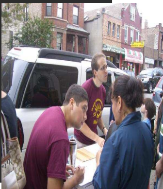
UIC NNLAM-LaRaMA members and a voter.